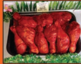
1.5kg Tray Tandoori Chicken Drumsticks £6.50