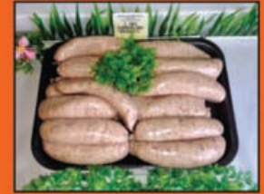
1.5kg Tray Cumberland Sausages £8.25