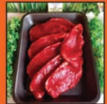
1kg Tray Chinese Pork Steak £9.95

SUMMER IS ON IT'S WAY AND SO IS BBQ SEASON Free delivery to your door! HANDCROSS BUTCHERS LTD QUALITY BRITISH MEATS