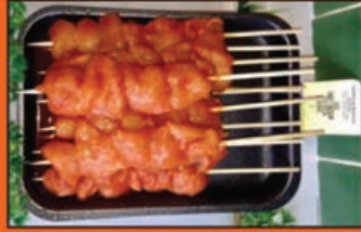
1kg Tray Thai Chicken Kebabs £9.95