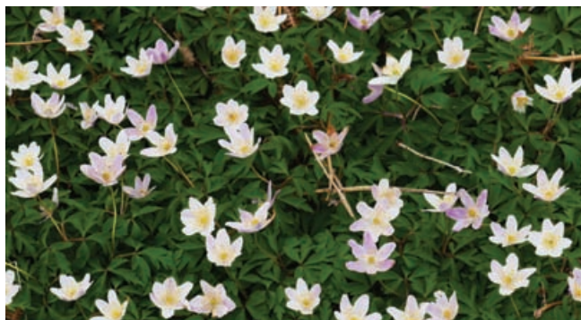
Anemone Nemorosa, photographed on Ditchling Common

The Common is maintained by appropriate management that, if neglected, will rapidly lead