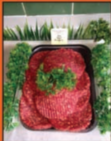
8 x 4oz Steak Burgers £9.00

Give us a call to choose your favourites on: