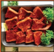
1kg Tray Minted Lamb Chops £18.00

SUMMER IS ON IT'S WAY AND SO IS BBQ SEASON Free delivery to your door! HANDCROSS BUTCHERS LTD QUALITY BRITISH MEATS