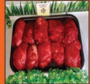
1.5kg Tray Chinese Chicken Thighs £7.95

Windyhills, Handcross, West Sussex RH176BN