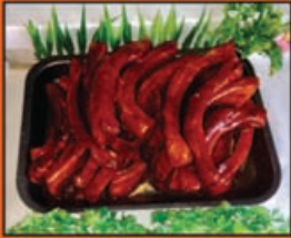
1kg Tray Meaty BBQ Ribs £6.98