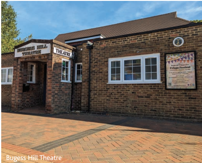
Burgess Hill Theatre