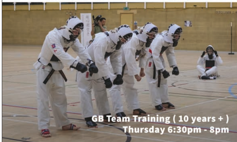
GB Team Training ( 10 years + ) Thursday 6:30pm - 8pm