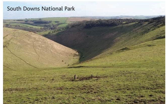
South Downs National Park

To find out more, contact the Help Point Team on 01444 247726 , email helppoint@burgesshill.gov.uk or pop in to 96 Church Walk, Burgess Hill, RH15 9AS.