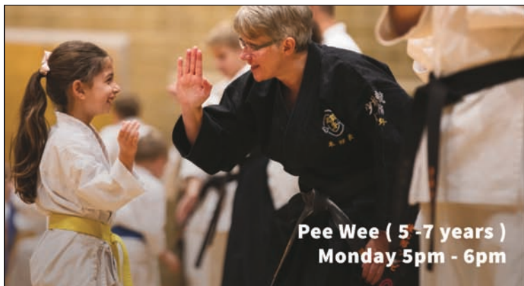
Pee Wee ( 5 -7 years ) Monday 5pm - 6pm