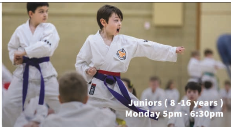
Juniors ( 8 -16 years ) Monday 5pm - 6:30pm