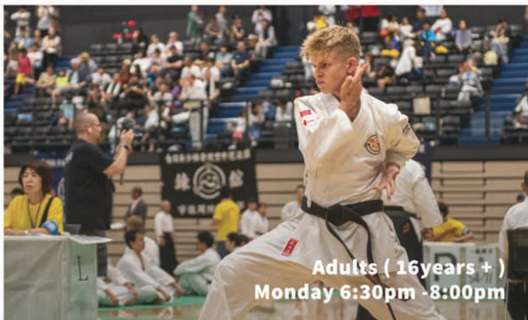
Adults ( 16years + ) Monday 6:30pm -8:00pm